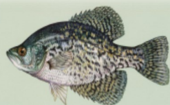
Black Crappie Pomoxis nigromaculatus