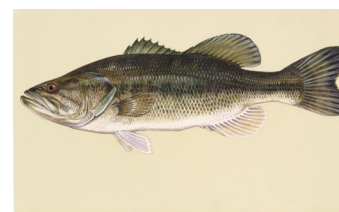
Largemouth Bass Micropterus salmoides