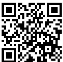
Dine on Campus