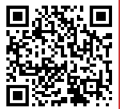
Student Info SP