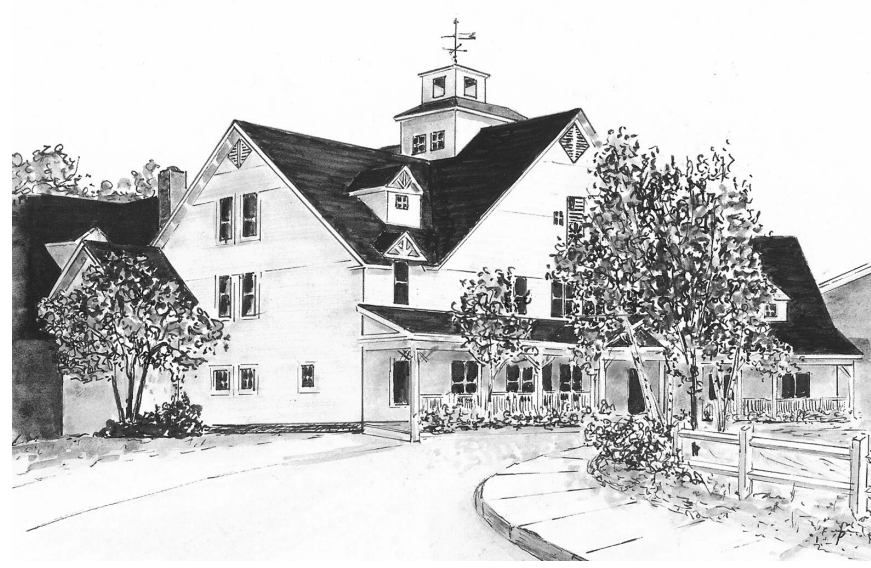
Simon Center, New England College